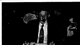
Pepper looks a bit bemused.