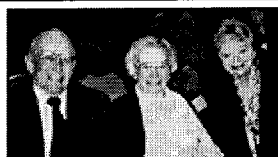
The Hausts with Dotty Landing.