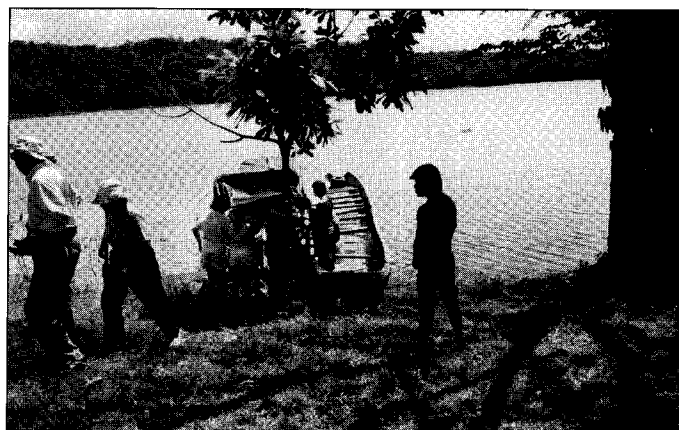
Boat trip to the Indian village (we took the one on the left--not the dug-out canoe).