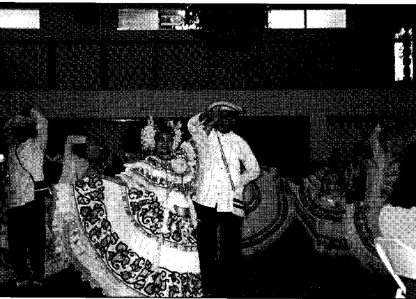
Entertainment by folk dancers (yes that's all real gold, and the petticoat cost $1,000) during the (tarde tipica), a traditional afternoon of food and drink. If that's typical, no wonder they need a siesta.